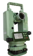
DT202C-Z Auto-collimating theodolite