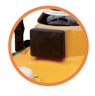
Millimeter wave radar