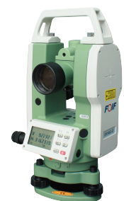
DT402-Z Auto-collimating theodolite